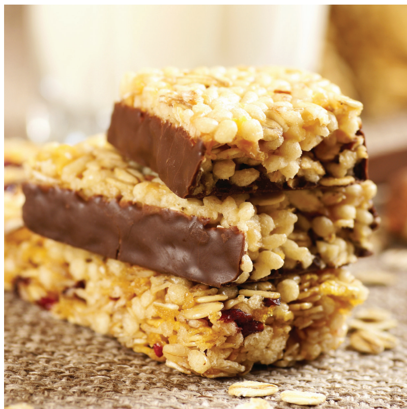
FIGURE 2: U.S. DAIRY INGREDIENT COMPOSITION AND ADVANTAGES IN BARS

Nutrition bars, bites, and even balls can be baked or unbaked (cold manufactured). Cold manufacturing utilizes either an extrusion process or binders (sugar syrups) that allow the ingredients to adhere together prior to cutting to the desired bar shape and size. Textures may range from crunchy granola cereal to chewy nougat. Often, bars and bites will be coated in chocolate or other flavors. U.S. dairy proteins are